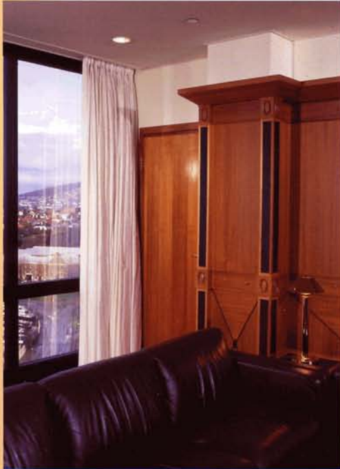
NAP timber acoustic doors installed in an executive office.

The NAP range of timber acoustic doors is the result of extensive laboratory testing, backed up with over 25 years practical experience in the acoustic industry. With many proven standard and special applications throughout the world, NAP Silentflo are the leaders in the field of timber acoustic doors.